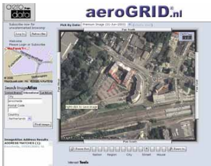
Figure 5 Off-the-shelf data provider from the Benelux

Using the Vecxel Ultracam-D, which supports a high degree of parallelism in data collection, transferral and processing, we can reduce costs and diminish environmental effects. The result is unrivalled radiometry with