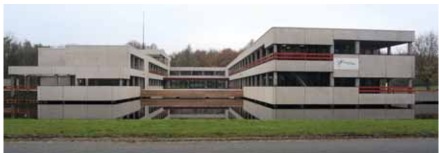
The Geomatics Business Park located in Marknesse in the Northeast Polder, the Netherlands