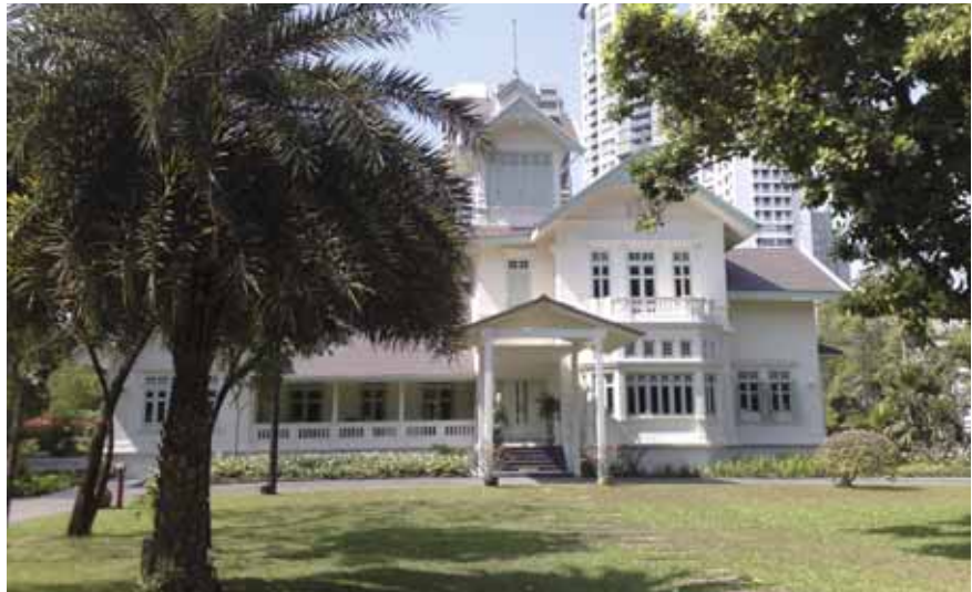
The venue of the alumni reception: the residence of the Dutch ambassador in Thailand

Some 70 Netherlands alumni attended the reception hosted by the ambassador and NAAT (Netherlands Alumni Association of Thailand). The ITC chapter of NAAT was well represented by 20 attendees, who had lively discussions and enjoyed the buffet dinner.