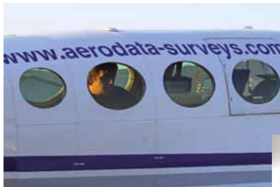
Figure 3 Aerial survey mission execution using a Cessna 402