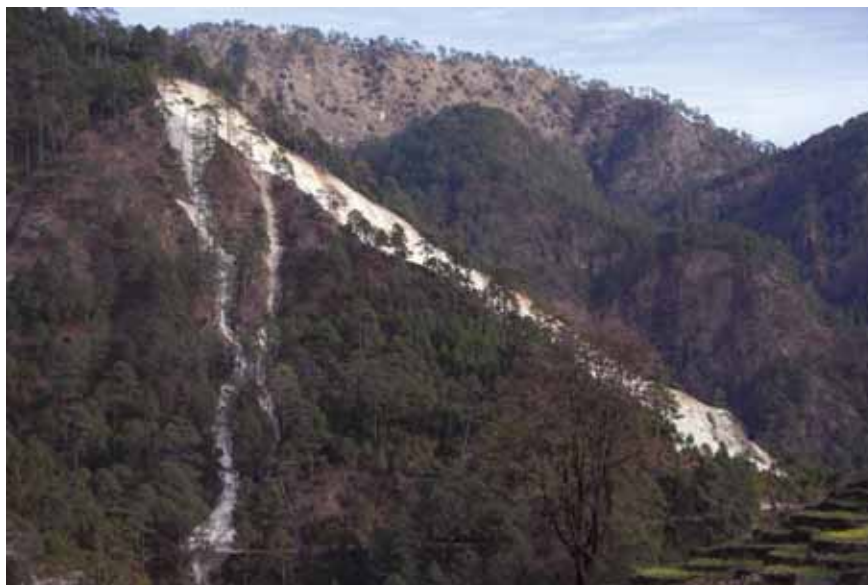
In 1998 a very large landslide occurred around Okhimath, along the Mandakini River, blocking the river and destroying several villages, even on the other side of the river