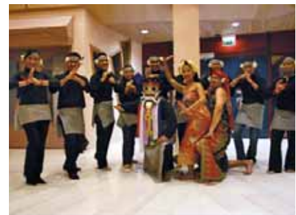
International Evening, 20 November 2004

for a doctoral degree at ITC or at other higher education institutions in the Netherlands. I also feel that more information regarding such opportunities should be supplied and that developing joint research with the institutions where alumni work would be a good idea.