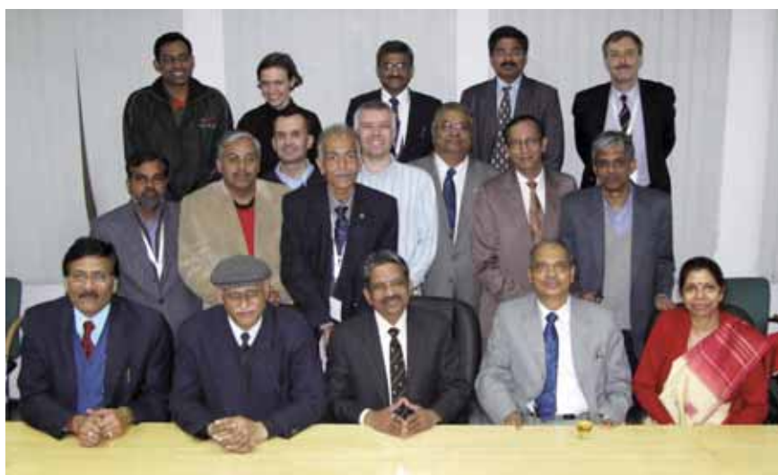
ITC alumni and ITC staff