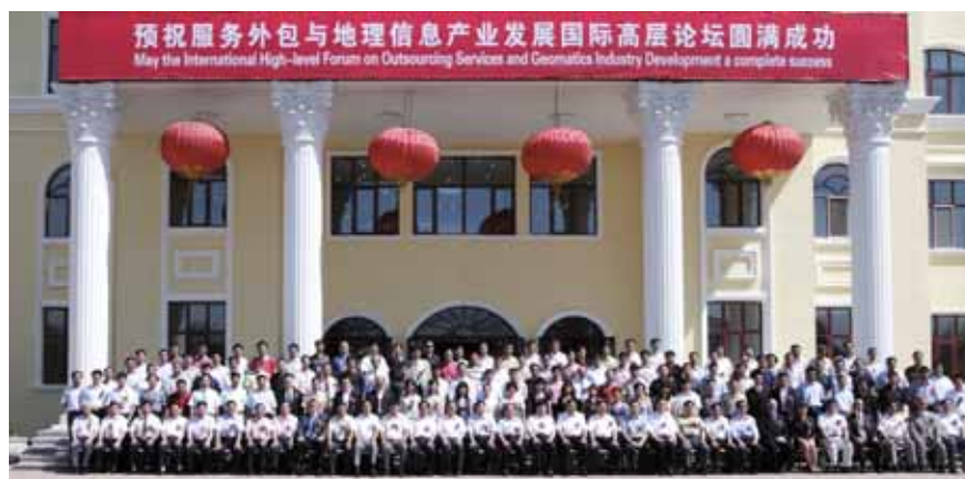
The International High-Level Forum on Outsourcing Services and Geomatics Industry Development in June 2007 signalled the official opening of the industrial park