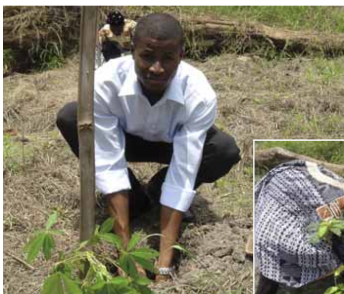
Plant a tree and save a life: the graduates contributing to a healthy environment

The formal ceremony attracted a large audience, including the vice-chancellor and pro-vice-chancellor of the university, numerous staff and many students. There were a couple