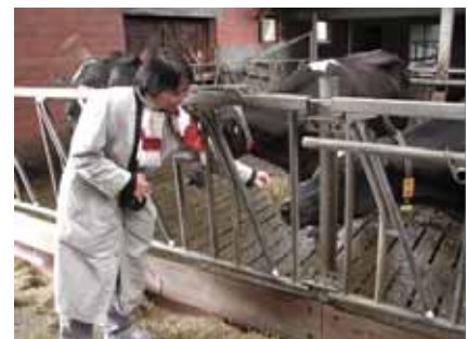
NRM field trip, 28 October 2003