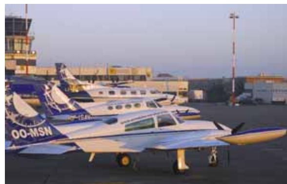
Figure 2 Fully equipped survey aeroplanes ready to fly

and 4), which satisfies multiple end users and applications. The colour orthophoto mosaic at 40 cm ground resolution is colour-balanced and shows a very high level of detail. Using the digital camera leads to significant improvement of the final product with respect to image clarity, brightness, contrast, and visibility of details in shadow areas. The aim of this product is to set a new standard for countrywide digital orthophoto