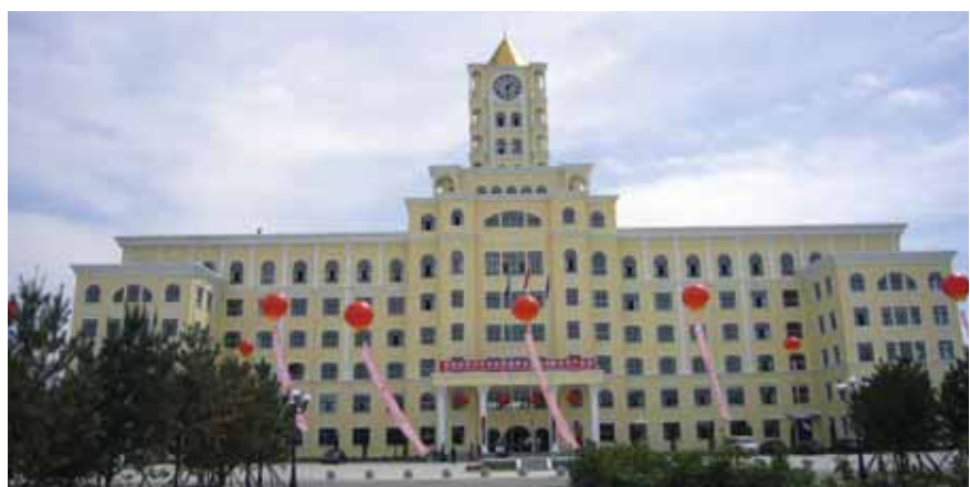
The Heilongjiang Geomatics Industrial Park in Harbin, China