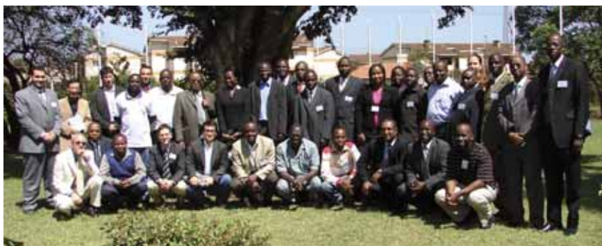
Group picture of participants and resource persons at the opening ceremony of the training course

For more information, please contact Zoltan Vekerdy (vekerdy@itc.nl). See also http://www.itc.nl/tiger