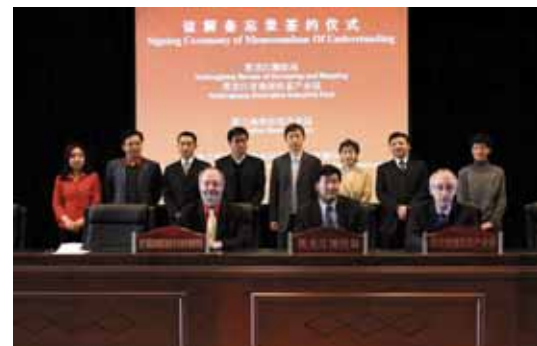
The Memorandum of Understanding was signed during a special ceremony at the Heilongjiang Geomatics Industrial Park in Harbin on 15 February

oped and carried out with support from programmes of the Dutch Ministry of Economic Affairs, thus enhancing scientific and economic collaboration between China and the Netherlands.