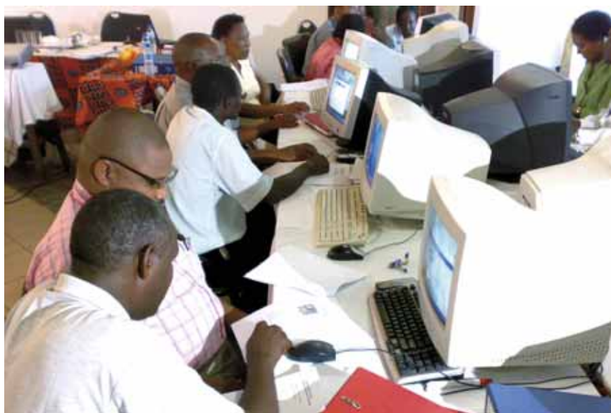
Course participants in class

A one-day excursion was organised to an informal settlement in Dar-es-Salaam: the Kinondoni district in the Hanna Nassif area. Here the participants were able to gain practical experience of poverty alleviation strategies and of management project activities. The Hanna Nassif area has made good progress in terms of urban poverty reduction and the participants were able to acquire first-hand experience of how the commu-