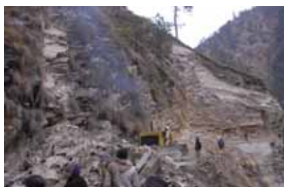
Visit to the Bagariya River, upstream of Uttarkashi: on this rainy day the slopes were reacting directly with small landslides

All in all it was an eventful and rewarding joint course, visiting the fieldwork areas of the PhD students and discussing their progress on site. The course was concluded with dinner and drinks offered by GSI.