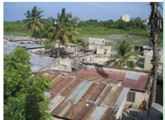
Poor housing in Tanzania