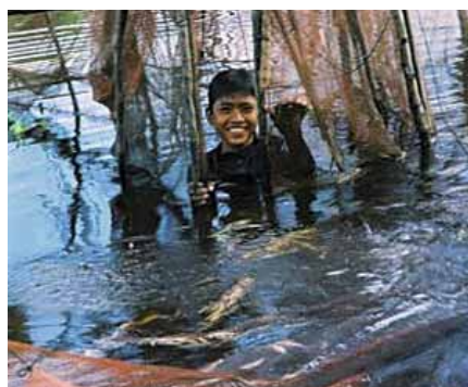
Fishing is an important source of income in the NSEC area