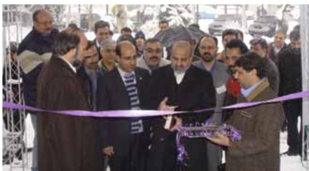
The official opening of the workshop Geo-Information and Decision Support Systems