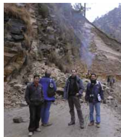
The purpose of this visit was to evaluate different aspects of a recent landslide that had affected the road and nearby army camp