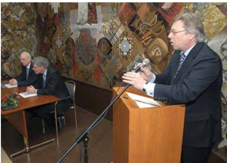
Mayor of Enschede Peter den Oudsten