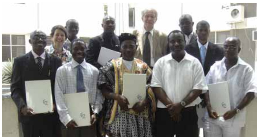
The second group (2006-2008) of graduates from the joint course in GIS for Natural Resource Management

They chose interesting and relevant topics for their MSc research and developed their research proposals at ITC. This done, it was time to go home and do their fieldwork in a more familiar environment. They ran after butterflies, explored what was left after fires had ravaged the forests, bothered farmers with long questionnaires, measured trees, and made long bike tours in search of fuelwood. Under the guidance of two supervisors, one from KNUST and one from ITC, they carried out their research and wrote their theses. And these they successfully defended on 26 and 27 March.