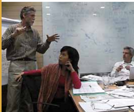
The team at work during the inception phase in Bangkok