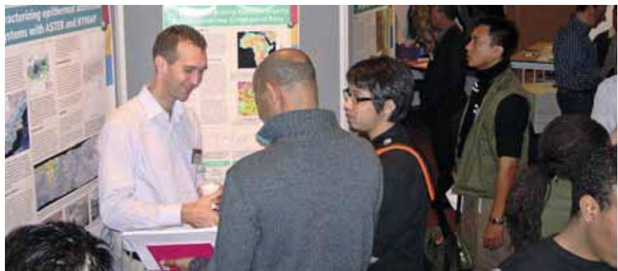
MSc Fair: The interactive poster session during the first MSc Fair

For more information on each research theme, see: http://www.itc.nl/research/themes.asp