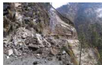
The landslide that nearly hit us all