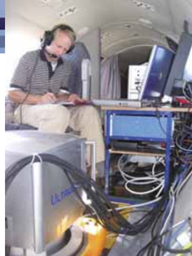
Figure 4 Ultracam-D in action during a mission over the Benelux