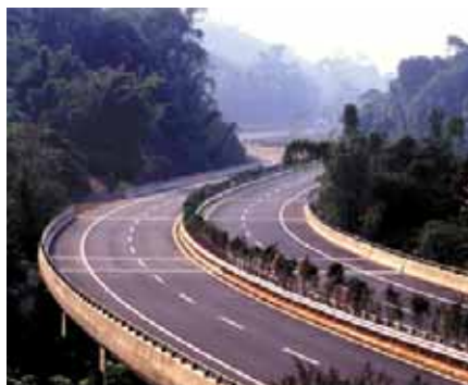
Sixiao eco-express way in Kunming

For more information: http://www.gms-eoc.org