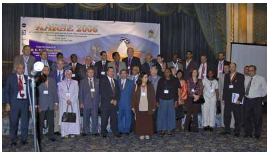
The Local Organizing Committee, International Organizing Committee and the Executive Council of AARSE with the 6th AARSE Conference Award winners for the best paper presentation, best poster and best paper by a young Scientist in Cairo, Egypt

In 2004, AARSE became an organisational member of GEOSS. Its active participation in the International Council for Science (ICSU) Regional Office for Africa, the UNESCO-GOOSE Programme, UNESCO-IYPE, UN-ECA CODIST (Committee on Development Information, Science and Technology), the African Reference Programme, Mapping Africa for Africa, and other initiatives in the African continent, as well as the unparalleled open support it enjoys from various remote sensing and GIS institutions and governments in Africa, is a reflection of its success and commitment to the betterment of Africa. This is not just about prestige. There is recognition that space is an essential tool for decision making and is a useful tool for Africa. These are no isolated developments. Across Africa, there are more than 20 national space agencies (also referred to as national remote sensing agencies), and there are also regional centres and universities with special expertise in this field. Nearly all are connected (as institutional members) to AARSE.