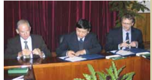
International Cooperation between CDUT and ITC on Research and Capacity Building 14 Dec 2007, Chengdu, China