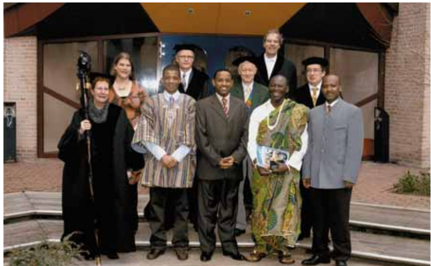
First graduates of the joint ITC–University of Twente MSc degree course Governance and Spatial Information Management

For more information about the MSc degree course in Governance and Spatial Information Management, please refer to www.itc.nl/education/courses/course_descriptions/C08-GSIM-MSc-01.aspx