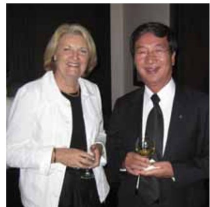
Some 70 Netherlands alumni attended the reception hosted by the ambassador and the Netherlands Alumni Association of Thailand