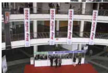
Conference registration at Map India 2008