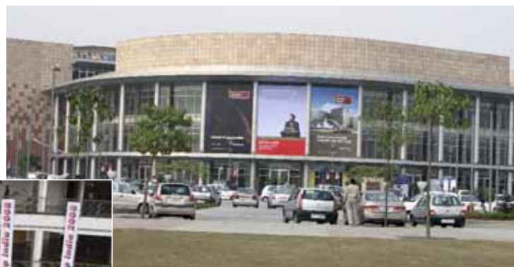
National Exhibition Centre, Greater Noida, venue for the Map India 2008 conference