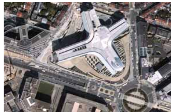
Figure 6 European Commission building in Brussels