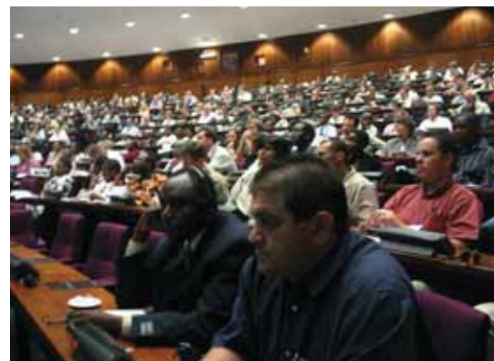
AARSE 5th Conference in Nairobi, Kenya

More information about AARSE can be found at www.itc.nl/aarse