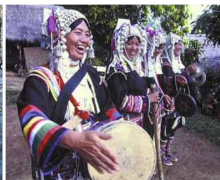
The NSEC is home to many ethnic communities