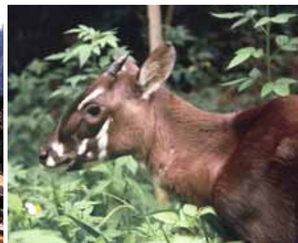
The NSEC region has a rich biodiversity