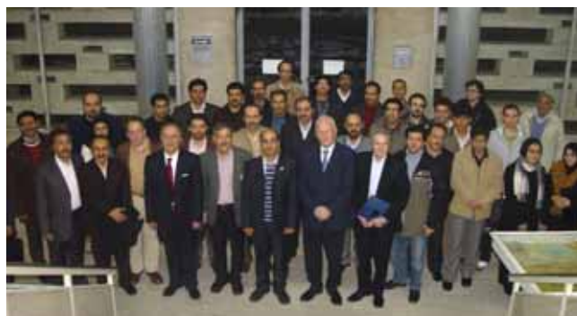
The workshop was attended by delegates from Turkey, Austria, China, Russia, Germany and the Netherlands