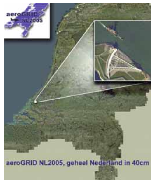
Figure 1 Aerogrid 2005: the whole Netherlands in 40 cm resolution

The Ultracam-D digital camera system is tied to a GPS-aided IMU, capturing imagery from a fast-moving Fairchild Merlin survey aircraft and from the Cessna 310 and 402 (Figure 2). The UltraCam-D simultaneously records colour and colour-infrared imagery (Figures 3