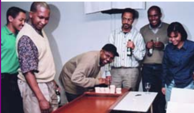
Dutch games in the Schermerhorn Lounge