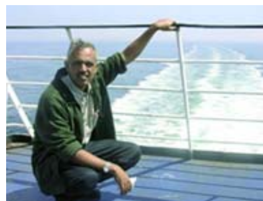
Going to London by sea