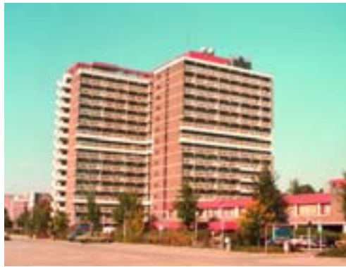
Once called the DISH Guesthouse.....

Technical progress has made it easier for students to stay in contact with home. In the early years, a form had to be filled in at the reception desk before making a phone call. Then the receptionist had to arrange the call by plugging in and switching between several lines - it could take hours before a connection was established! Nowadays, with e-mail, mobile phones, MSN chatting and so on, communication has become a lot easier.