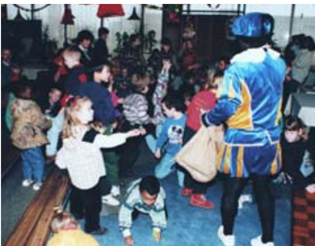
Each year at 5 December Sinterklaas and Zwarte Piet pay a visit to the Netherlands

The job position(s) I held since graduating from ITC are present: point person for operations, office of the director, bureau of land development, department of agrarian reform; previous: (1) office-chief, survey monitoring division, bureau of land development; chief of staff, office of the director and assistant director; head secretariat, centre for land use policy, planning, and implementation, department of agrarian reform. The most important change in my life after graduating from ITC was responsibly contributed in the creation of the centre for land use policy, planning and implementation; and in institutionalization of the same in regional units or nationwide. Actively participated in national level inter-agency technical working group in the formulation of a national physical framework plan. Instituted reforms in various units resulting to better delivery of services to stakeholders of the agrarian