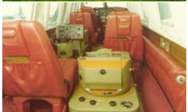
ITC's Aircraft NADAR with a Wild RC-10 aerial survey camera inside