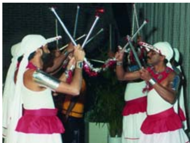
Highlight of the year: the International Evening

I was the Production Manager/GIS Analyst at the Survey Department of Jamaica until 1998 I am now the GIS Analyst at the Planning Institute of Jamaica working in the Sustainable Development and Regional Planning Division. The most important change in my life after graduating from ITC was watching me grow and