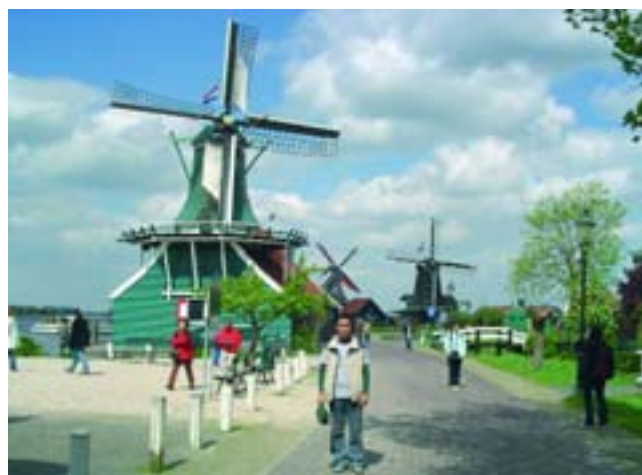
Windmills at the Zaanse Schans

for my PhD in Saitama University, Japan and new exposure in the field of GIS and RS. What I liked most about studying at ITC is teachers and other staffs of ITC are so much friendly, and working in pressure. My best memory of the Netherlands is the peaceful country, friendly people and so many beautiful places. As an ITC graduate my ambition is to still achieve best opportunities that are possible for me at ITC. To my fellow alumni I would like to say let's make our alumni much stronger, expand it and be in touch. ■