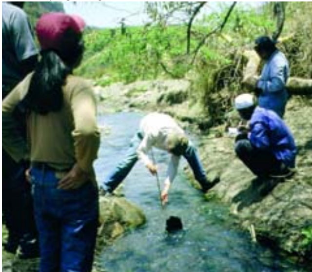
Water sampling during fieldwork