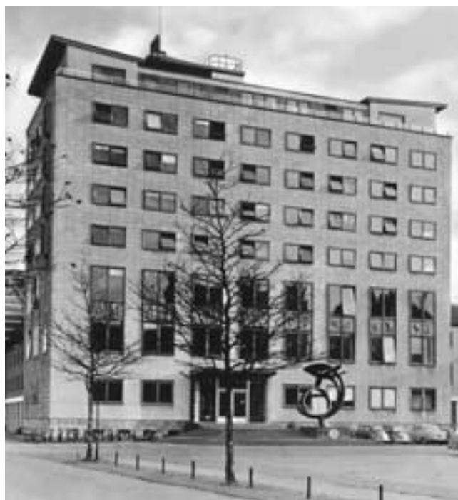
ITC building Delft

The job position(s) I held since graduating from ITC is Mapping and GIS Officer GIS Specialist. The most important change in my life after graduating from ITC was to understand correctly the importance of spatial data with all its attributes for best practical use to implements the natural resource management programs. What I liked most about studying at ITC is Cooperation and coordination from all the teachers and friends. My best memory of the Netherlands is travelling in train from Enschede to all part of the Netherlands. As an ITC graduate my ambition is to still achieve to be a famous GIS specialist of the world. To my fellow alumni I would like to say work hard to get new innovation in the field of Geoinformation science and provide the efforts for your nation development. ■