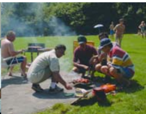
A day out and a barbecue