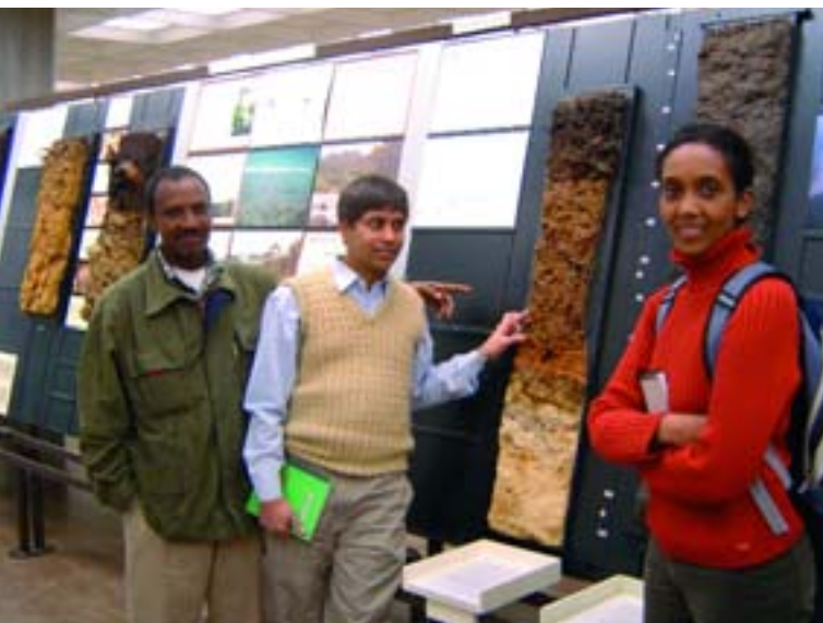
Soil exhibit at ISRIC, Wageningen