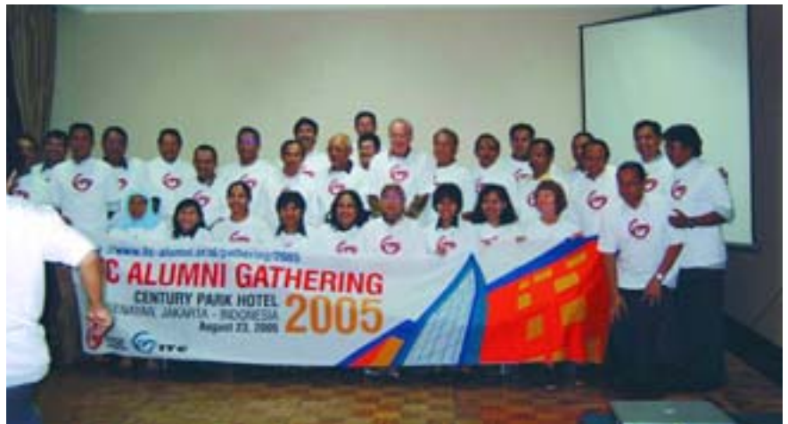
Group photo at the end of the meeting