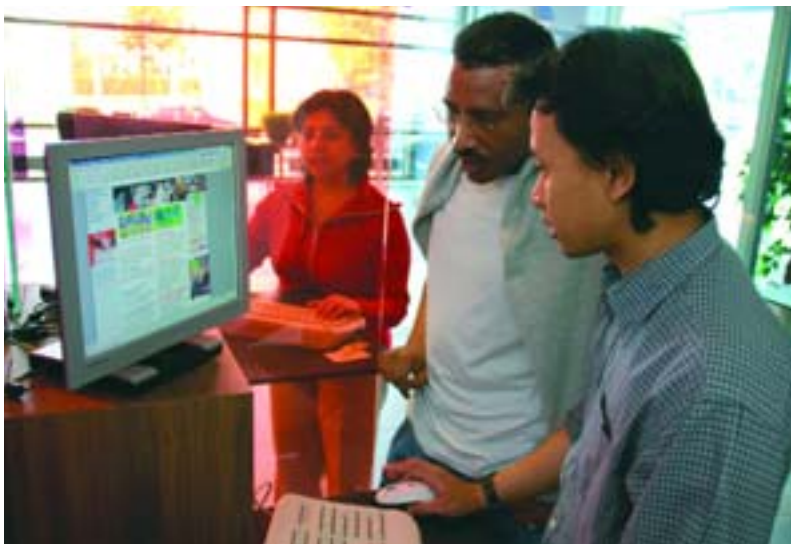
Students can now make use of Internet facilities in the lobby of the ITC International Hotel