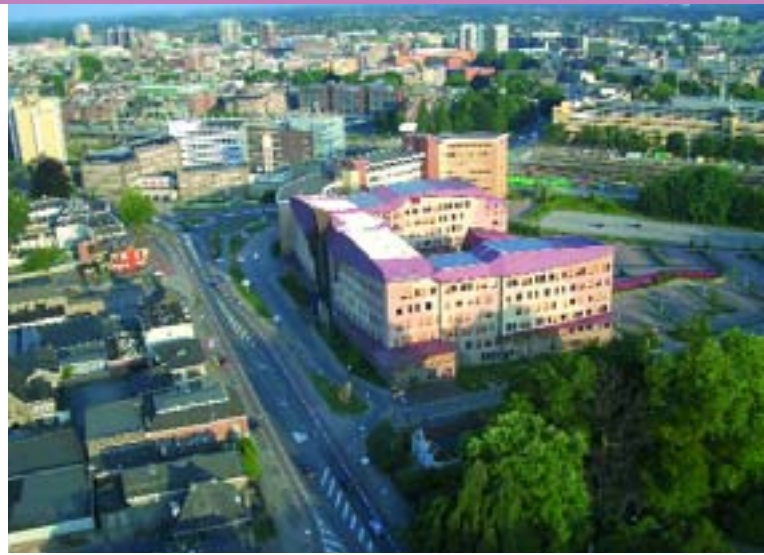
The new ITC building at the Hengelosestraat

The job positions I held since graduated from ITC are Town Controller, Chief Architect Planner and Project Chief of Bhaktapur District of Kathmandu Valley Town Development Committee looking after overall planning, implementation of urban development and land development projects. Since 2003 I am Section Chief of