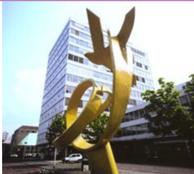
The 'Kronkel' in front of the former building at the Boulevard

reform program, particularly on land use management and development. What I liked most about studying at ITC is foremost, the ambiance and prestige; abundant of friendliness; the methodologies applied facilitates learning. ITC tampers weaknesses; draws out strength and best to the max. The process used enhances critical thinking with pragmatism and strengthens skills; professors are excellent; no subject seems too difficult. Professors and staff are most helpful and extend personal attention when need arises. Should I be given another chance, I would take another course at ITC. Hail to ITC. My best memory of the Netherlands is plenty of them, and who could ever forget: the cold weather; the freezing snowy field work; winter white Christmas; the bus trips around the Netherlands; the oneness of Filipinos; marketing and preparing meals in droves; holy week not observed by many; spring festival; visits or gatherings of Filipinos on birthdays and holidays. As graduate on RLE.3, I wish I would still be given a chance to have an MSc degree at ITC! To my RLE.3 batch mates, drop me a line or two. To all fellows, wouldn't it be nice to form a borderless ITC republic? What do you think? ■