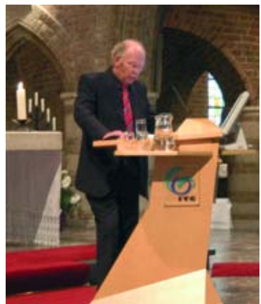
Professor Ian Dowman, President ISPRS

He went on to say that we see photogrammetry being used today in many areas not traditionally linked to map making, for example, for recreating cultural heritage pictures. Many people, probably everyone with access to television and newspapers will have seen satellite pictures of disasters such as the Indian Ocean tsunami but other scientists who wish to use such data still need to be educated to use the data properly. We also need to ensure that the data reach the people who need it and that they have the equipment to read it. Hence we need interoperability. "My message today is that we need to look at the big picture and work