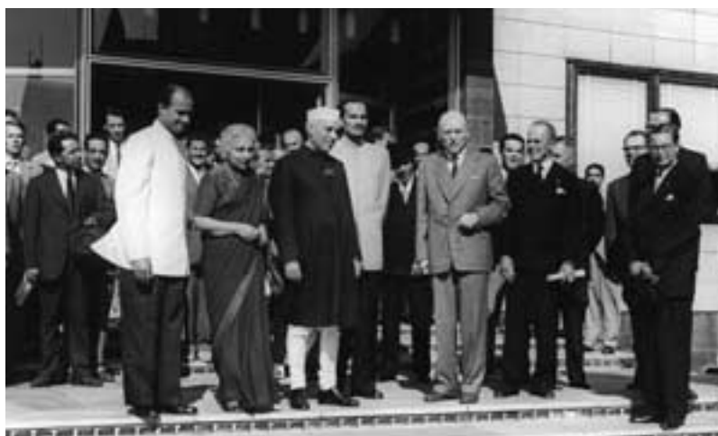
Prime Minister Nehru and Professor Schermerhorn in front of the building in Delft (1957)

To make student life a bit easier, microwaves and ovens can be found in the kitchens. Preparing meals can be difficult - especially for those who have never cooked before. Another experience is buying groceries in a strange country: images on food cans do not always indicate the contents ... and pets also eat canned food!