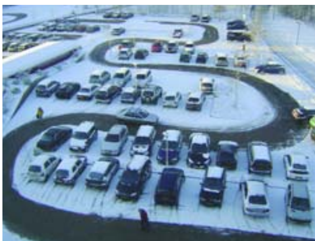
ITC's parking lot covered with snow

The job position(s) I held since graduating from ITC is surveyor P.C. 6. The most important change in my life after graduating from ITC was my father just past away for 2 months. This is the biggest change of my life. Myself, I've got promotion which means I have more responsibilities and work harder. What I liked most about studying at ITC is the environment of studying there, for example, the way of supervisors distribute their knowledge and assign for self-study. Also all facilities that ITC provided made our life comfortable. My best memory of the Netherlands is a "bicycle" ..... :) With bicycle, I could go to ITC, supermarket, lake, the Chinese restaurant, my friend's apartment, and also Germany (that time we didn't have the train from Enschede to Germany),