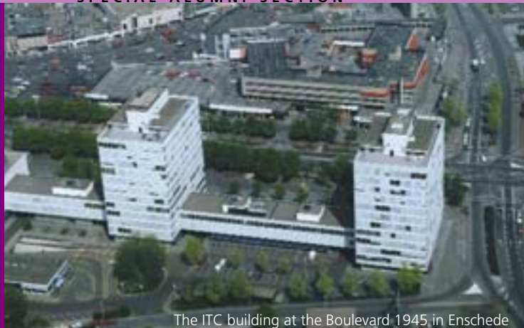
The ITC building at the Boulevard, 1945, in Enschede

lified teaching staff with research and work experience in various regions of the world; - Excellent combination of class work and field work; - Up-to-date educational facilities. My best memory of the Netherlands is the site of a dyke (I have forgotten the location & name of the dyke) that I visited as part of my class field work in the Netherlands. As an ITC graduate my ambition is to I am planning to start soil conservation and reforestation projects at community level in my homeland Afghanistan, through establishing an NGO which will work closely with farmers in the villages. To my fellow alumni I would like to say that I still remember you. ■