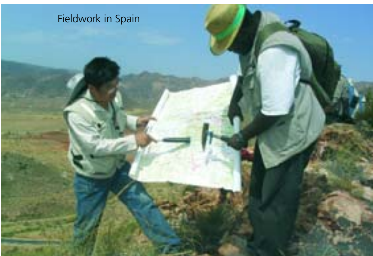
Fieldwork in Spain

on 22 Nov 2000. Then the life changed after graduating from ITC, now I am becoming a resource person in RS&GIS and keeping me busy with my daily works. What I liked most about studying at ITC is the simplest thing I like is that even a person (I can call a lay-man) who has no knowledge about computer can even become a master in RS&GIS. Because the basic concept of the modules mainly focusing to understand the subject and the teaching staffs. My best memory of the Netherlands is there are many things. The different culture from different country. One need not visit every country to know their culture but be at ITC and the common kitchen. Next the Friday night with chilled tin beer after every busy module. Apart from that the beauty of the country that one can enjoy and always remember. As an ITC graduate my ambition is to still achieve I have lot of ambition to do some work on habitat management of wild elephants and grass land ecology of Tamilnadu. To my fellow alumni I would like to say hope my friends from ITC are still having more touch than me in the field of RS&GIS. If not at least spent some time to enjoy the pleasure of RS&GIS. This will give one day an opportunity to meet our old friends and to exchange so many new assignments and experiences. ■