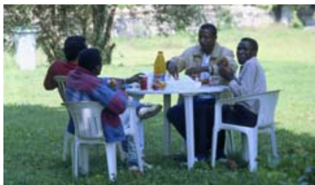
Time to relax during fieldwork

The job position(s) I held since graduating from ITC are: Senior Land Surveyor. The most important change in my life after graduating from ITC was application of GIS in conducting company assignments (electric power utility) and as well my private jobs. What I liked most about studying at ITC is GIS; theory, practice and related field trips. My best memory of the Netherlands is peace, maximum security (life and properties), normal living standard and a