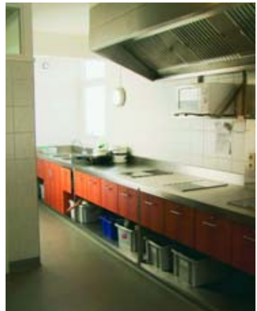
One of the kitchens in the ITC International Hotel after the renovation