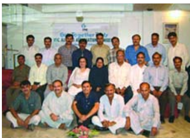
Attendees at the formal establishment of the ITC Alumni Association of Pakistan

At the end of the party small refreshments were served and some good photos taken of the event.