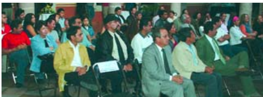
Audience (participants and staff)