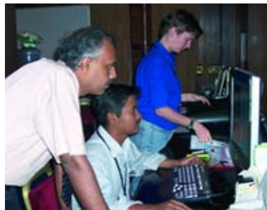
Working at CNO with Map Action UK

I would like to study further and hope that I will achieve my dream one day. In conclusion, I am very thankful to ITC for enabling me to explore the world to some extent and for laying a path for the bright career ahead. All best wishes to ITC on its 55th birthday for rendering tremendous service and leading the dissemination of spatial and environmental knowledge in various ways. And all best wishes to the staff of ITC for their well being and in achieving their goals.