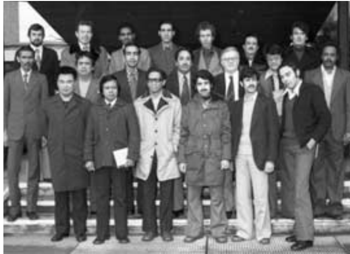
P.4 course students 1976-1977

It's my pleasure to attach to this e-mail a photo of the P.4 course students (1976/1977), and I hope they can recognise themselves 28 years ago! The photo was taken at the WILD company in Switzerland on 3 March 1977.