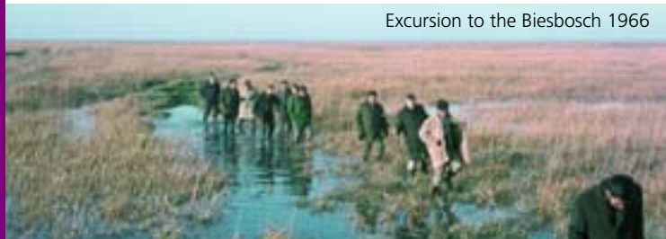
Excursion to the Biesbosch 1966

ple. As an ITC graduate my ambition is to still achieve 1. Research position in the best universities in the world. 2. Run a successful geo-information business. To my fellow alumni I would like to say thank you for everything! I've enjoyed wonderful time with you in ITC. May we all benefit the society in the same way we've prospered! God bless you all. ■