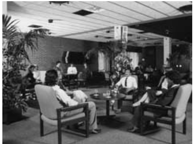
The Schermerhorn Lounge in the 1970s

The job position(s) I held since graduating from ITC are: Cartographer(Grade 1), In 1996 I've got a promotion as a Technical Officer (Cartography)-Supra Grade, From 2000 I am working as a Staff Grade Technical Officer(Cartography). The most important change in my life after graduating from ITC was I've got a valuable Certificate of the "Diploma in Cartography". It is very useful to me when applying for promotion or any other relevant jobs not only Sri Lanka as same as other countries. What I liked most about studying at ITC is when doing practices in the Cartography room, because most of the time we spent in cartography room and improved our friendship with other country friends. My best memory of the Netherlands is field trip to Germany for one week and Brussels trip. As an ITC graduate my ambition is to still to achieve to improve my GIS knowledge and if I got a chance to study at ITC again it will be a great success in my life. To my fellow alumni I would like to say let me know any future progress about our alumni association and I would like to keep my membership in my whole life. ■