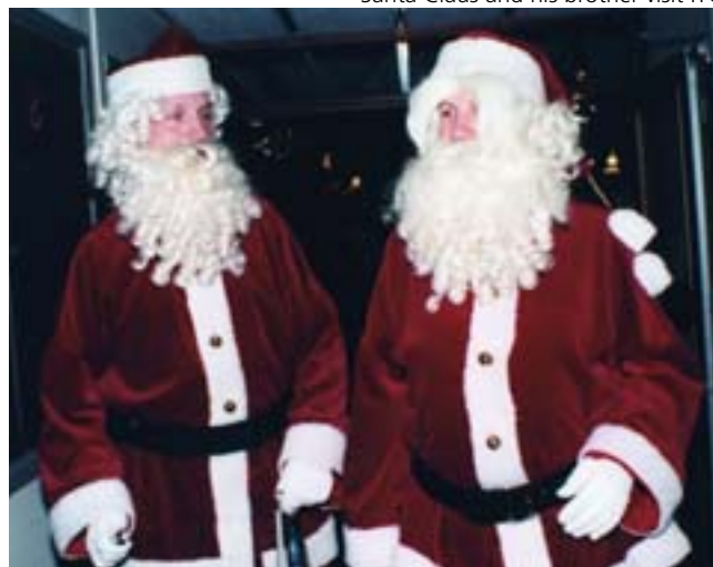
Santa Claus and his brother visit ITC

The job positions I held since graduating from ITC are Upazila Nirbahi Officer (UNO)(Chief executive officer of sub-district) at different stations. Present position: Deputy Director, Department of Environment. The most important change in my life after graduating from ITC was I am now very much submissive to my collea-