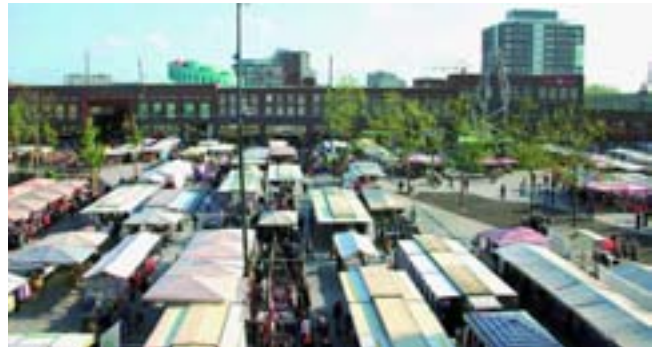
The open market in Enschede

What I liked most about studying at ITC is learning with hard working. My best memory of the Netherlands is hard working and the stresses by supervisors during the MSc research work. Not yet achieving my ambition as I am not working in the area related to my education in ITC. To my fellow alumni I would like to say: Life in ITC might seem very hard especially the style of their education (Do it by your self), but after ITC you can see its benefit by comparing with other colleagues studying somewhere. In other aspect it was very difficult to visit some areas in The Netherlands due to the shortage of time as a result of too many assignments. ■