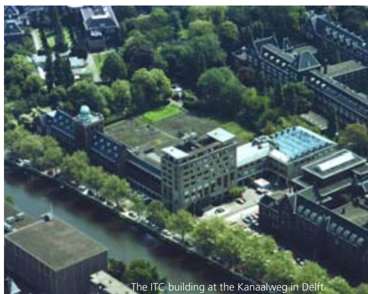
The ITC building at the Kanaalweg in Delft

The job position(s) I held since graduating from ITC are soil survey assistant. Soil survey specialist. Deputy Head of Gedaref soil survey substation. Land evaluation & Remote sensing unit Wad Medani. Soil Researcher, Land & Water Research Centre, and ARC, (land degradation &Desertification studies, assistant prof.). The most important change in my life after graduating from ITC was increased my capabilities in soil survey work. Remote sensing gave me the chance to winding my imagination about problems facing me and their solutions. I am able to teach myself by myself. What I liked most about studying at ITC is that the theories were very linked to the practical. Up to date studies. My best memory of the Netherlands is the pleasant spirit of The Netherlands nation. The beauty of the people and their land. As an ITC graduate my ambition is to still to have a direct contact with the ITC, and to updating my knowledge the field of remote sensing and GIS. To my fellow alumni I would like to say collectively we have to work for better life for word wide nations. Best wishes and regards....thanks. ■