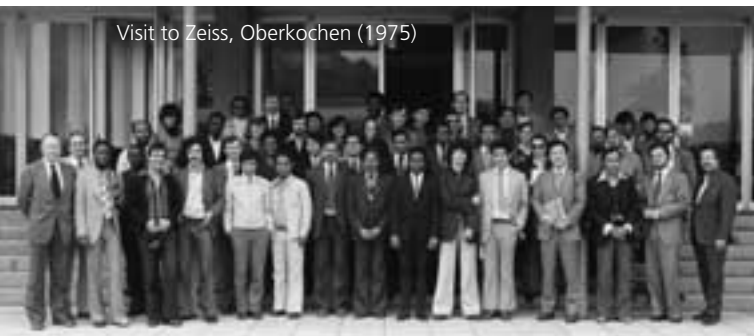
Visit to Zeiss, Oberkochen (1975)

The most important change in my life after graduating from ITC was my progress in the work place. What I liked most about studying at ITC is the team spirit and hard working as well as time management all of which had contributed significantly on my promotion. My best memory of the Netherlands is law of human respectability - Lining up during purchase in supermarkets and even in the Institute Cafe; both the VIPs and the simples (Students) alike. - Harmonious End of the Module parties where equally all enjoy irrespective of academic and social status. As an ITC graduate my ambition is to still achieve more in geoinformation for Natural resources management especially in our beloved South Sudan that have just awoken from War destruction. To my fellow alumni I would like to say that all the academic suffering we complained about at ITC is an excellent weapon in our progress. - The more you are academically stressed, the stronger and better you become; hence efficient contribution to your societies and countries development. - For those of our batch (2002 - 2004), don't forget our common comforting phrase: "The war is already done and you come to collect the reward destined to you at ITC". ■