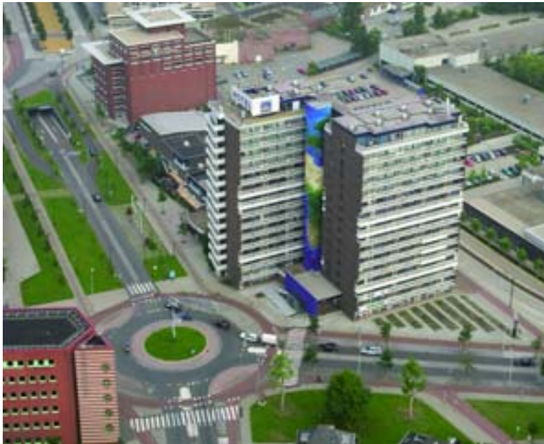
.....now the ITC International Hotel

Many things have changed over the last 55 years, but what will never change is our goal: to create warm, clean and pleasant surroundings for our students, where they can eat, sleep, study and socialise - and, most important, feel at home, away from home .