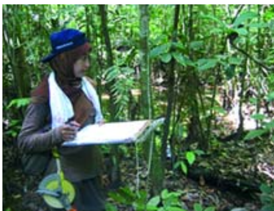
Fieldwork in East Kalimantan

I have known about GIS/remote sensing since I was a student at university. Since then I have wanted GIS and earth observation to become my field of expertise. ITC has given me knowledge and more as regards GIS and earth observation. Life at ITC will always be kept inside my heart as a beautiful memory.