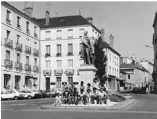
Chalon-sur Saone 3 August 1986. Students in photogrammetry, on their way to fieldwork in the South of France, pay a tribute to Nicephore Niepce (1765-1833) the inventor of photography (1822)