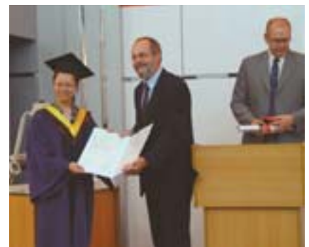
Awarding the degrees: 47 students received MSc degrees from Wuhan, of whom 11 also received MSc degrees from ITC