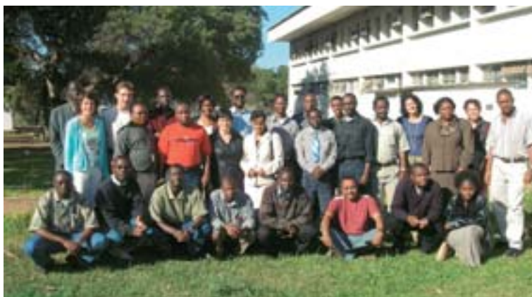
Participants and some of the lecturers of the refresher course in the garden behind the SETSAN building

The second week started off by examining with food security aspects: the analytical framework for food security including the socio-economic context with emphasis on vulnerability and coping strategies, availability versus needs. The role of GIS/Remote sensing in food security information