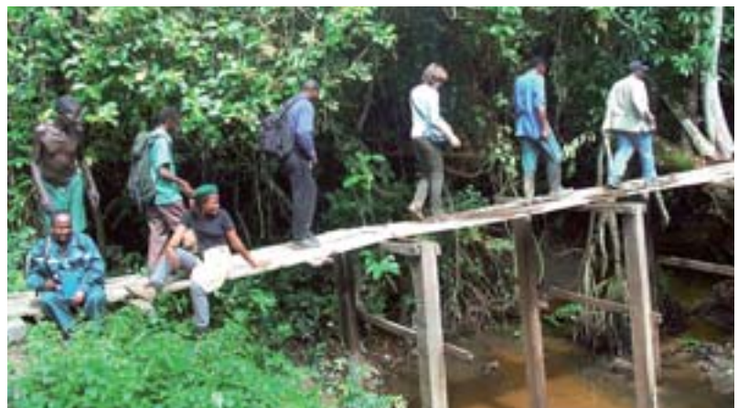
FIGURE 5 Field data collection by ITC staff and students and Forestry Commission