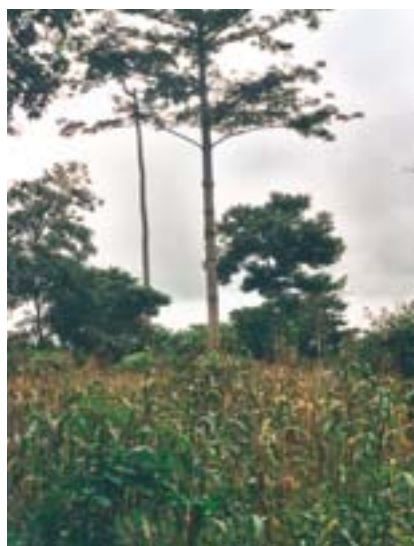
FIGURE 1 Off-reserve tree resources in annual cropland

However, with the ongoing intensive logging and gradual degradation of many forest reserves, these so-called off-reserve tree resources are becoming increasingly important as a source of wood products (for local commu-