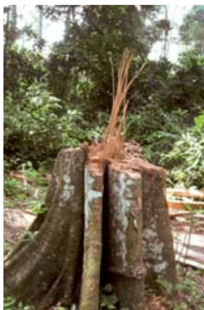
FIGURE 3 Illegal removal of a tree by farmers

A GIS will be used to visualise and integrate spatial data on the current conditions of the remaining off-reserve tree resources in terms of quantity and diversity (including NTFPs), other aspects related to the biophysical potential of the land, and the needs and aspirations of local stakeholders. This will lead to the identification of zones based on current quality or future potential, for which different options for a more sustained type of use/management will be recommended. The strength of the project lies in its spatial integration of biophysical as well as socio-economic aspects.