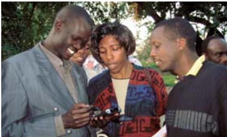
Practising with GPS and mobile GIS

If you are interested in following a similar course, please take a look at the description of the short course Remote Sensing-based Monitoring of Continuous Processes and Discrete Events, with Focus on Vegetation and Disaster Applications that appears on the ITC web pages ( www.itc.nl/education/shortcourses.aspx ) and the NFP website ( www.nuffic.nl/nfp ).