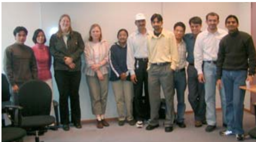
ITC staff and participants of the short course Building and Publishing a National Basemap Using PLTS

PLTS (production line tool set) has been developed by ESRI to provide national mapping agencies with an application that can be successfully employed in high-volume production environments. PLTS operates on top of ArcGIS and provides tools for data-base creation and maintenance, and the creation of high-quality output. The functionality includes feature-driven validation and symbolisation, batch and visual quality assurance, and customisable cartographic and map series generation.