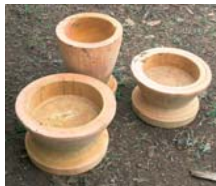
FIGURE 2 Local use of off-reserve trees: mortars for pounding grain and plantain

With the establishment of protected forest reserves in the first half of the 20th century, the pressure on off-reserve areas has increased. Discussions with the Forestry Commission reveal that agricultural intensification, restricted forest reserve accessibility for