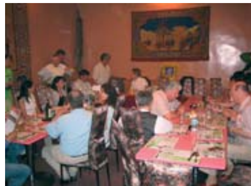
The alumni reception