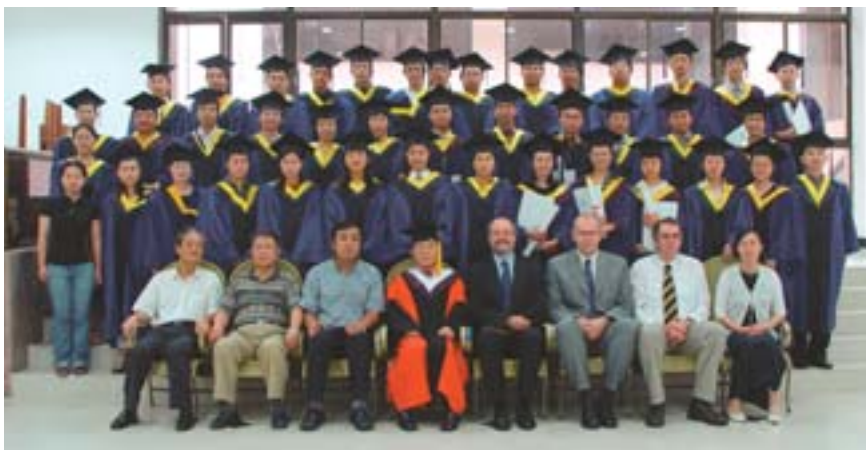
Group photograph of staff and new graduates