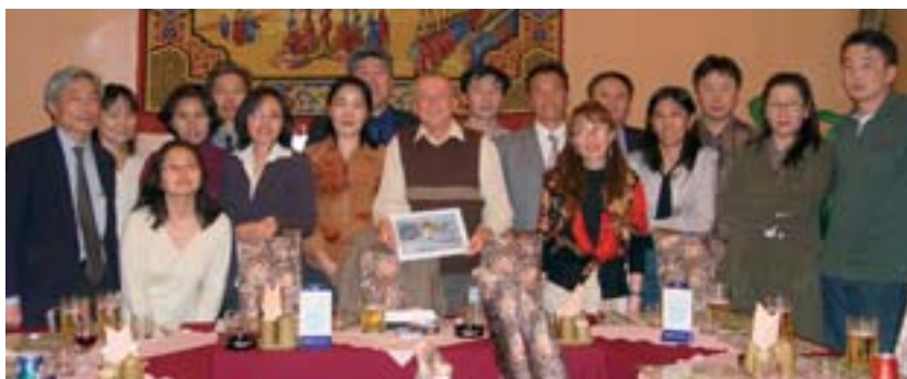
An ITC alumni party organised in the Chengis Khan Restaurant in Ulaan Baatar was attended by more than 20 ITC alumni