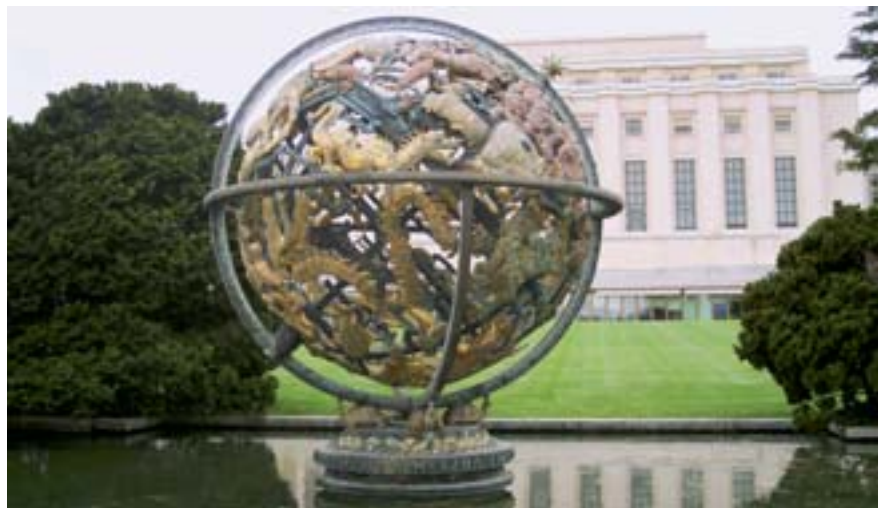
Palais des Nations, Geneva

Professor van der Molen concluded that land registration represented not the beginning of a reconciliation process but its end. The relationship between land reform and reconciliation was very strong, so that land reform might indeed be part of the reconciliation process. It was most likely that differing approaches would be needed in different post-conflict situations. Apart from the fact that countries differed in history, culture and attitude, post-conflict situations might themselves differ, requiring a specific policy. Land registration concepts might result in unconventional approaches. He went on to say that surveyors often failed to be involved in peace treaties. Experience had been built up on such unconventional approaches, but further research was required here.