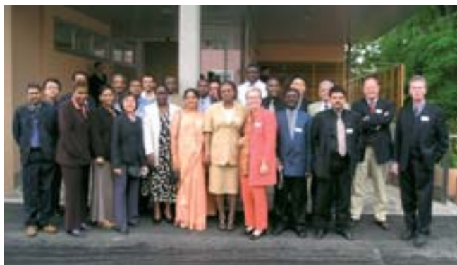
Commission 7, Cadastre and Land Management, of the International Federation of Surveyors (FIG) held an international seminar on e-Land Administration; ITC's GIM students participated in this seminar and contributed to the discussions